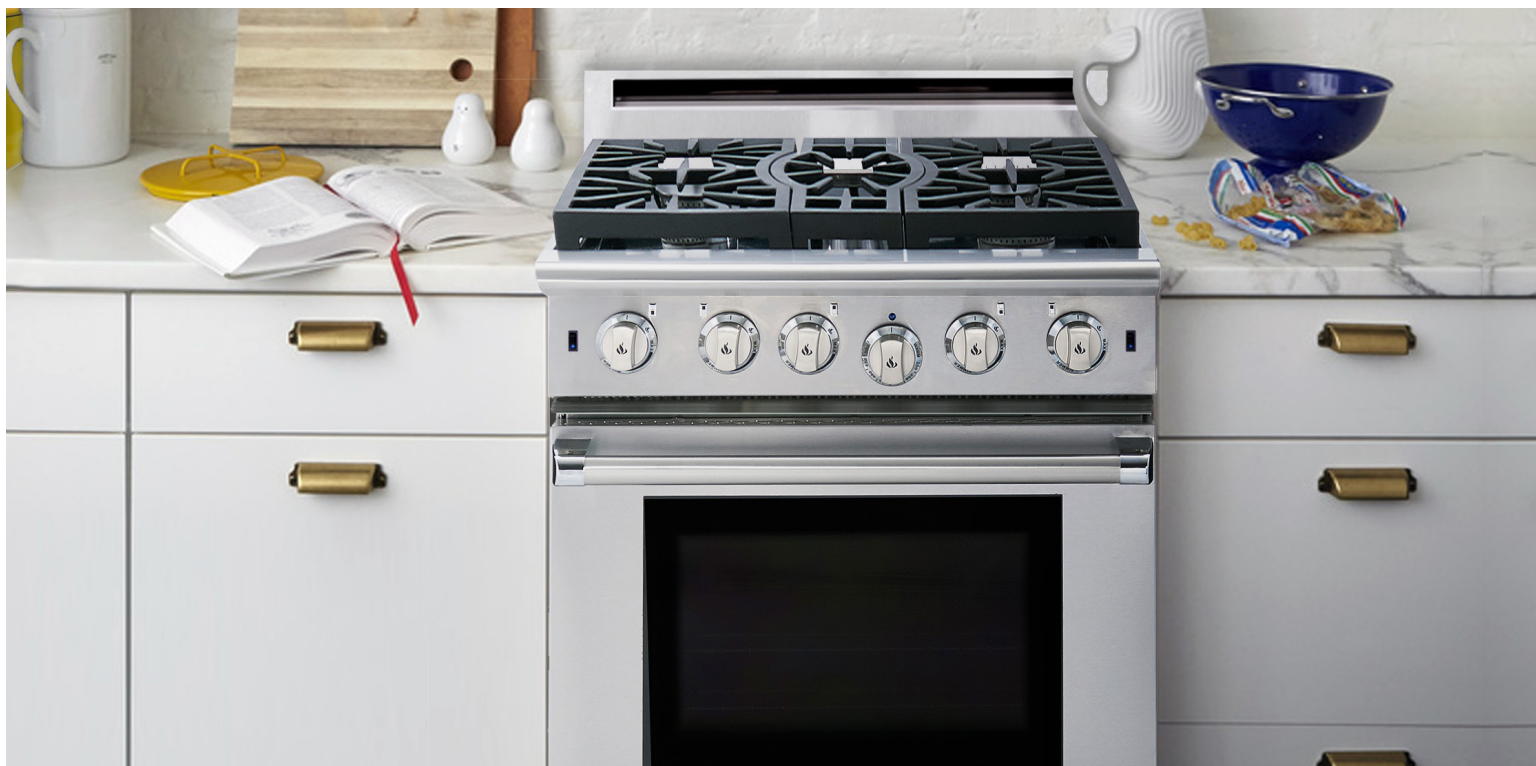
*ARR-530 Shown with 4" Stub Back Hand polished stainless steel finish