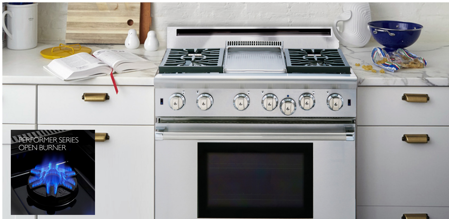
*AROB-436GD Shown with 4" Stub Back Hand polished stainless steel finish. Other models available