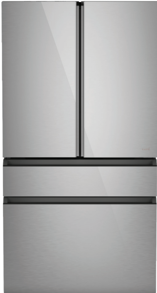
CGE29DM5TS5 Platinum Glass with Integrated Pockets