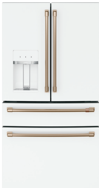
CXE22DP4PW2 Matte White with Brushed Bronze handles